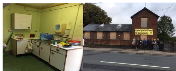
Evidence of non use & vandalism. View from the road with boarded windows