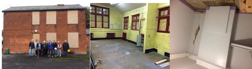
Old School House Exterior Refurbishment of internal halls Underpinning

Below are some pictures showing the building and challenges ahead